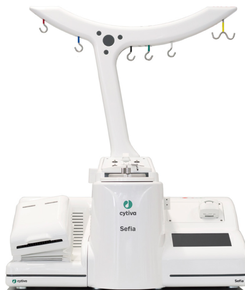
Fig 1. Sefia instrument. The mixer with temperature control is on the left, centrifugation chamber is in the middle, and touchscreen and barcode reader (not visible here) are on the right. Weight sensors are connected to the bag hooks at the top.